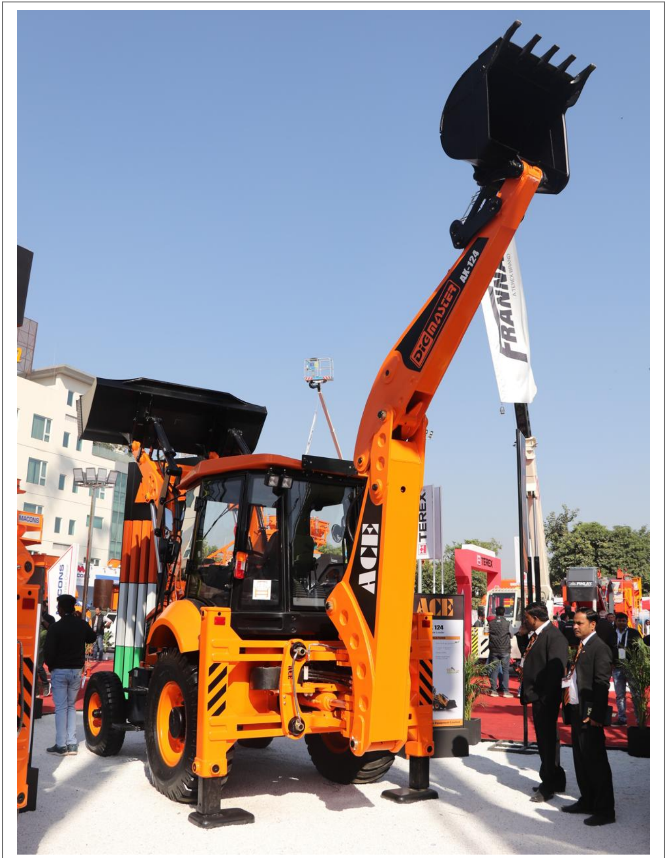
ACE Unveils Next-Gen BS-V(CE-V) Backhoe Loader at Bauma Conexpo 2024