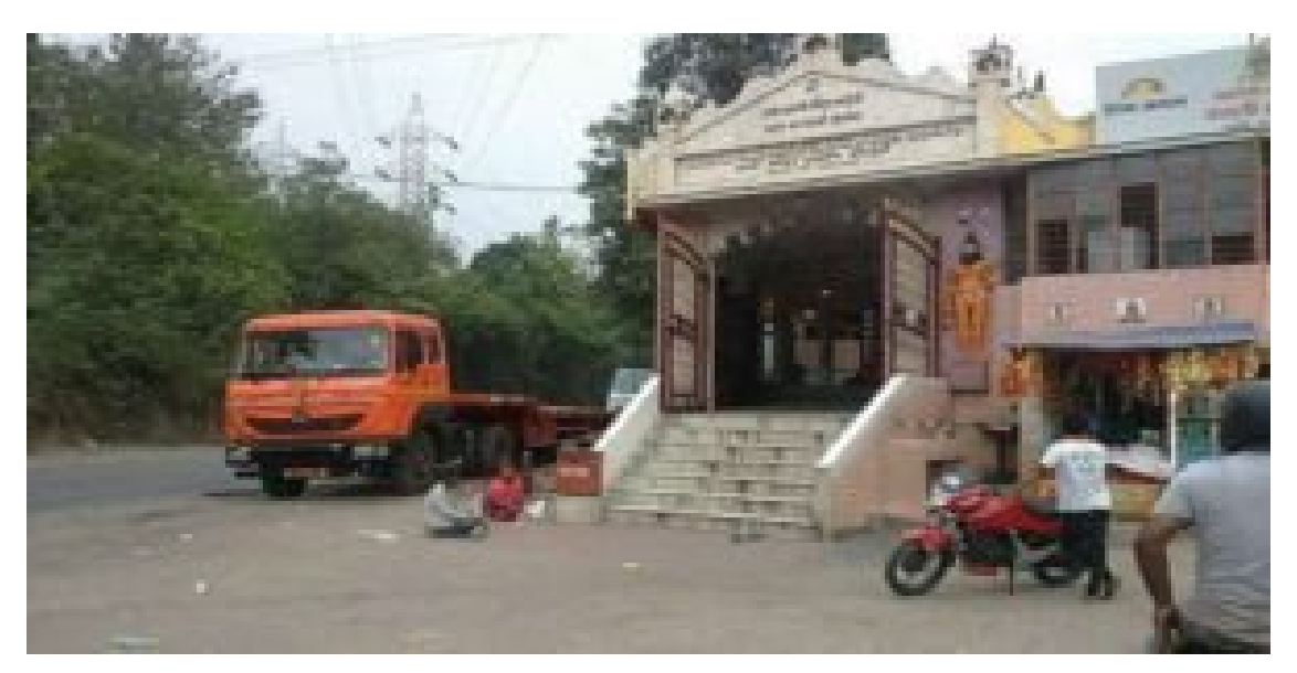
Kali Mandir Pardih Jamshedpur

The temple complex also houses smaller shrines dedicated to various Hindu deities, providing devotees with an opportunity to offer their prayers and seek blessings. The overall ambiance of the temple is peaceful and tranquil, offering a perfect escape from the chaos of daily life.