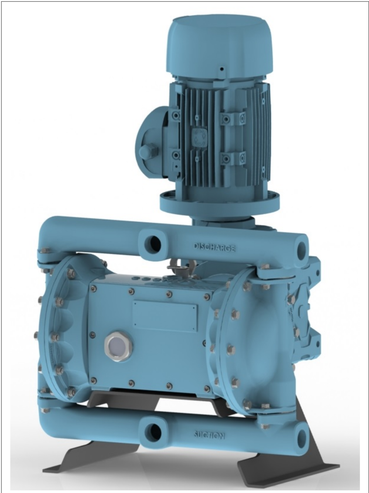
Cognito 1 EODD Pump

transforming industrial fluid pumping solution worldwide with its complete range of heavy-duty EODD pumps, namely Cognito 1 to 4 inches for various flow rates and applications requirement.