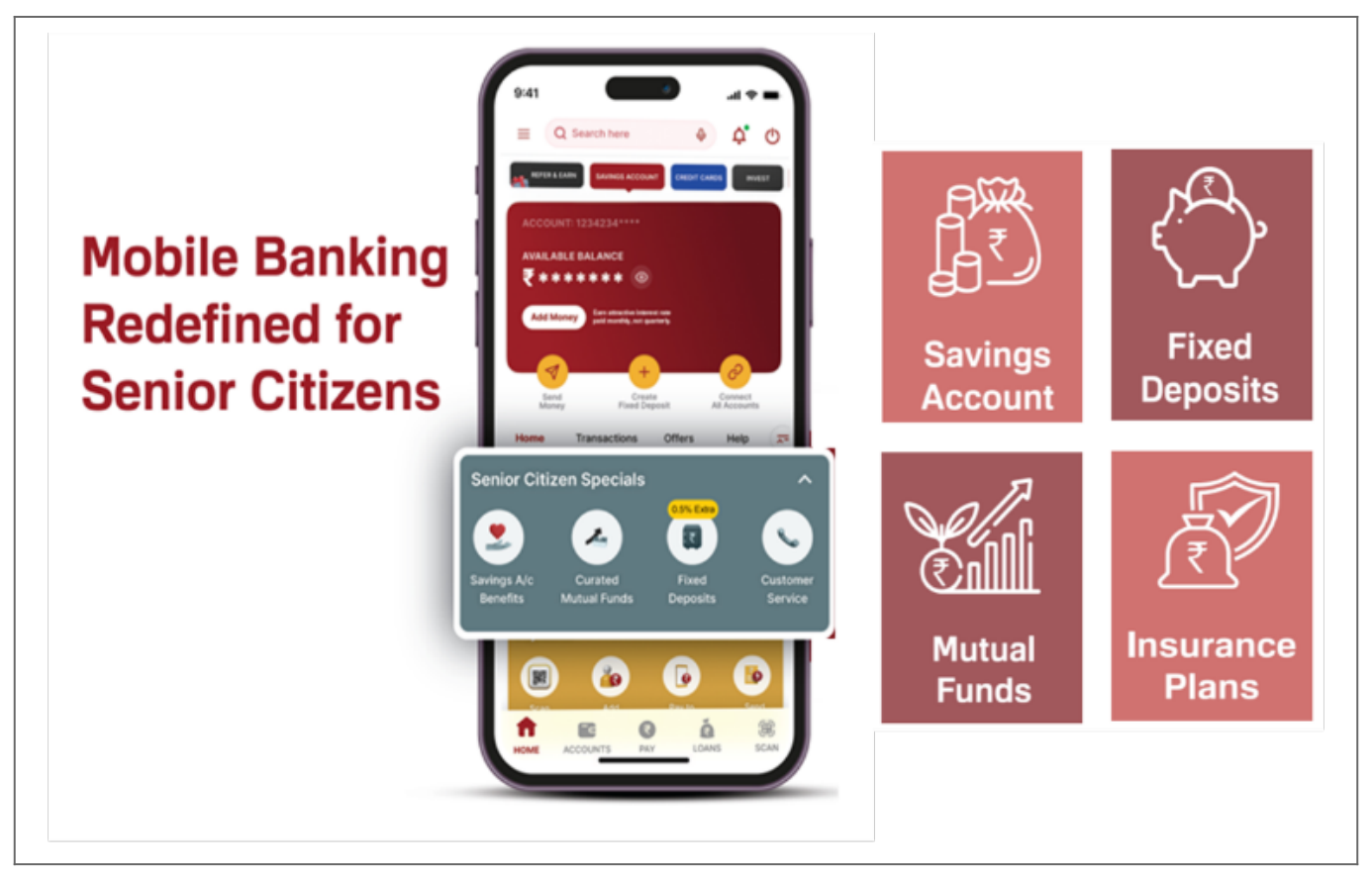
Mobile Banking Redefined for Senior Citizens

These offerings, include the <u>Senior Citizen Savings Account</u> and <u>Senior Citizen Fixed Deposits</u>, reaffirming the bank's commitment to provide superior, secured and customised financial solutions for this important customer segment.