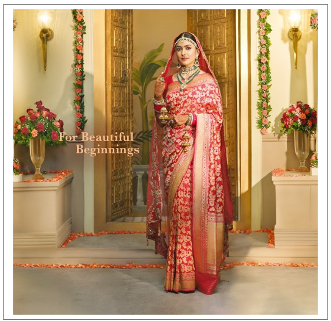
For Beautiful Beginnings by Taneira

Through the campaign, Taneira pays homage to the profound wave of emotions that unites brides regardless of region or tradition while highlighting the unique nuances that define their journeys. In this moment, the bride is not just draped in a saree- she is enveloped in the dreams, memories and hopes of everyone she holds dear. Across the seven regions captured in Taneira's 'For Beautiful Beginnings' campaign, the bride's saree, though diverse in fabric, drape, and design, becomes a universal companion on her journey of transformation.