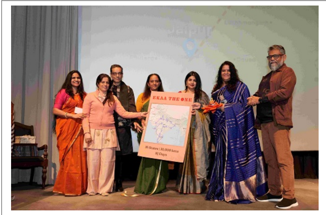
Team of Ekaa the One project